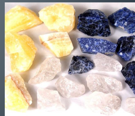
Harmonie und einklang