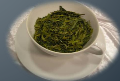
Pu Erh Tee Schwarzer Tee