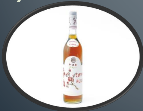
homemade Asian Glühwein