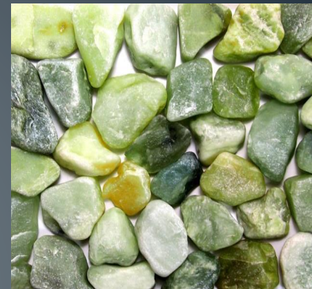
Grüne Jade Serpentin