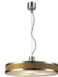
Pendelleuchte ESPRIT Lounge Ahorn