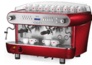
Espressomaschinen GAGGIA Deco dosta

All Investment costs are calculated without VAT (19%) except Caution, Advertisement cost, and Additional cost.