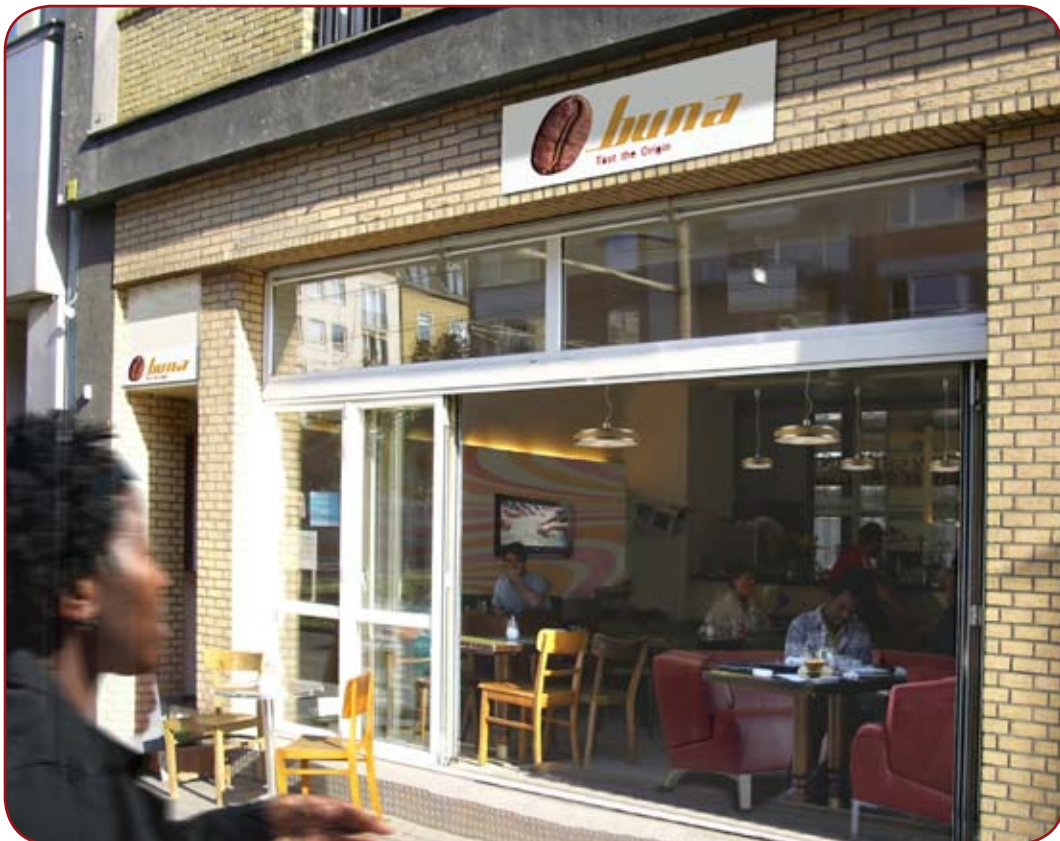
Collage of the buna coffee bar

As mention before we are planning for the furnisher atmospheric light, stylish and cosy chairs and sofas, and a flat screen. Before we start our business the place will be renovated by us.